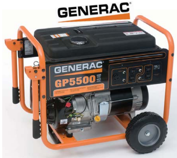
Generac 5500 Watt Pull Start *$649.00

A 5,500 watt pull-start, priced at *$649.00 and a 7,500 watt electric start generator, priced at *$950.00 by Generac are available. Or, a 10,500 watt Lincoln Ranger 225 Electric generator/welder may better suit your needs, priced at *$3,099.00.